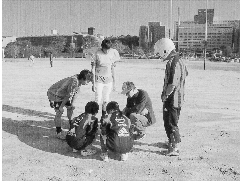
Fig. 1 Playing American Football