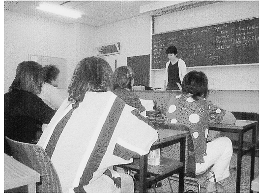
Fig. 3 The T.A. explains her favorite sport

The winner is the world's best athlete!"