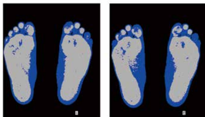
Figure 3 Changes in the sole ground contact area before and after wearing arch supports under static standing conditions (left : before, right : immediately after)